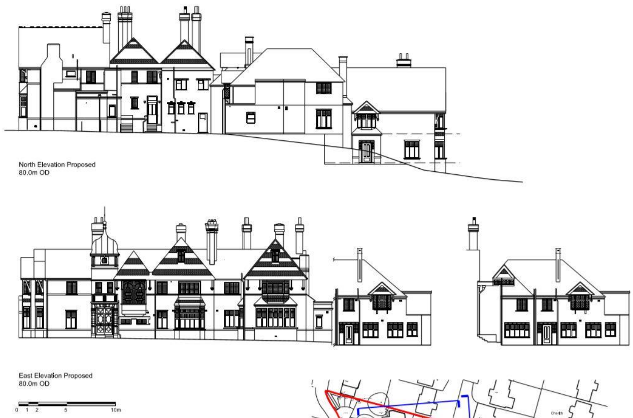
Fig 3. Proposed north and east elevations.