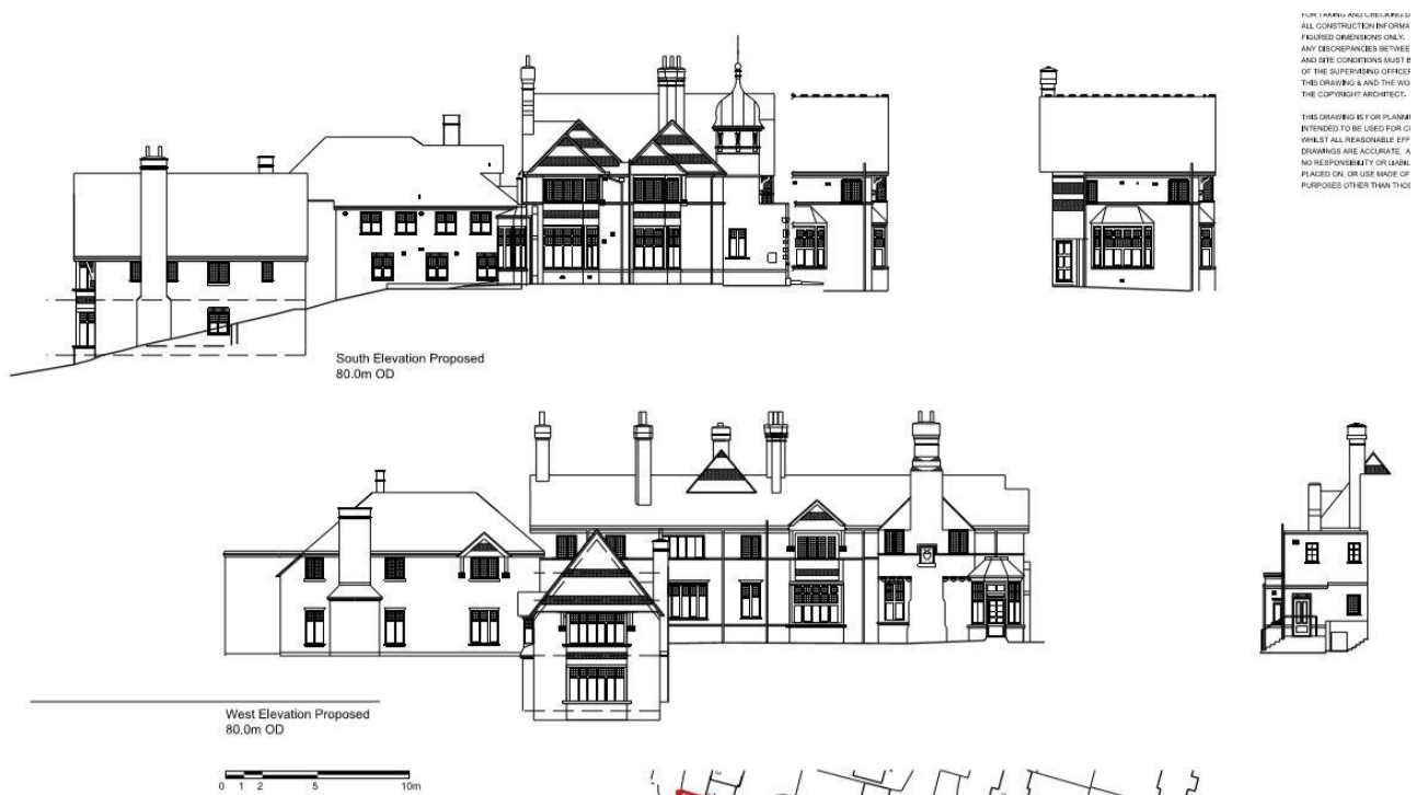
Fig 4. Proposed south and west elevations.