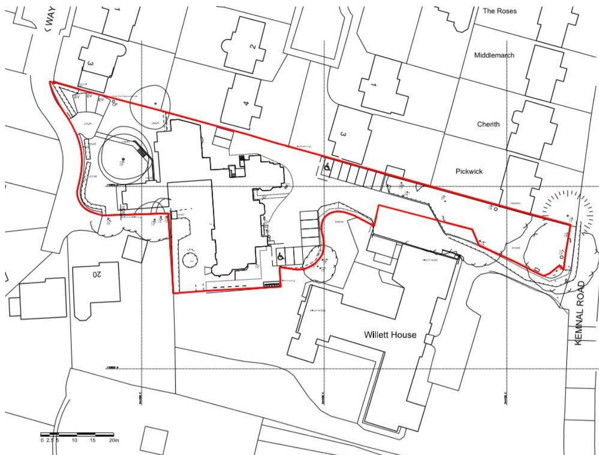
Fig 2. Proposed site layout plan.